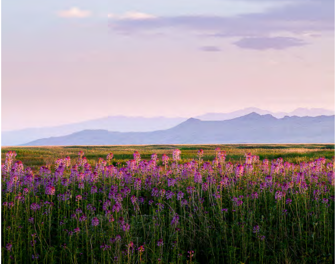
Rocky Mountain Bee Plant at Great Salt Lake Shorelands Preserve

Those who wait for God shall renew their strength. They shall mount up with wings like eagles, they shall run and not be weary, they shall walk and not faint. - Isaiah 40:31