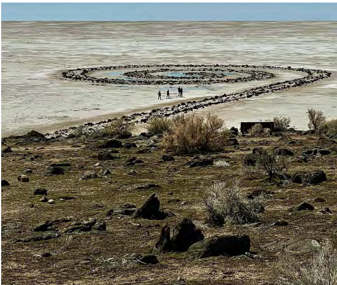
The Spiral Jetty in 2023

As soon as Jesus was baptized, he went up out of the water. Suddenly the heavens were opened, and he saw the Spirit of God descending like a dove and resting on him. - Matthew 3:16